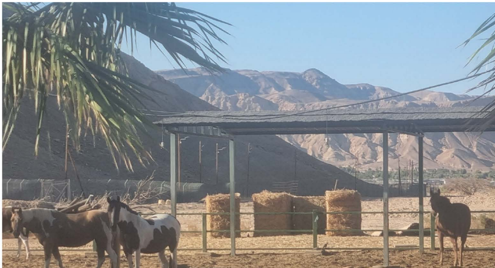
Kibbutz Grofit, located near Eilat, in the southern Arava.