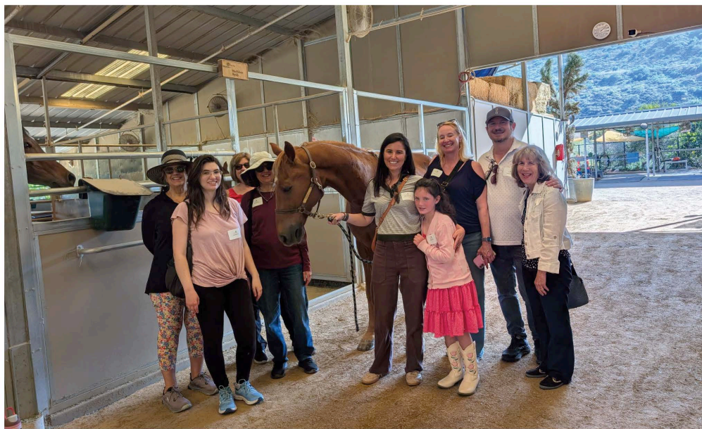
Members of our JCFOC community at the Shea Center site visit on May 7, 2026

The Shea Center is doing transformative work with vulnerable populations through therapeutic horseback riding. During the visit, guests toured the facility, observed programming in action, and learned about the incredible care and respect shown to both the riders and the horses in the program.