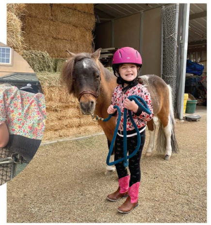
Two adorable riders with their beloved therapy horses.