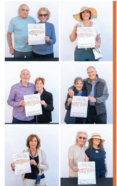
MAZAL TOV to this year's Endowment Book of Life signers!