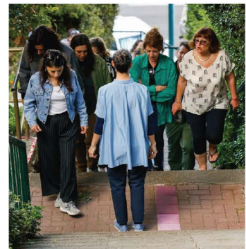
HaTikva Neighborhood, Tel Aviv