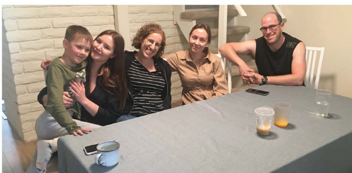
Since April 1, 2022, OCJCR has provided flights, accommodations and pocket money to ten Ukrainian families. Pictured above is a Ukrainian family assisted by Irvine OCJCR volunteers.