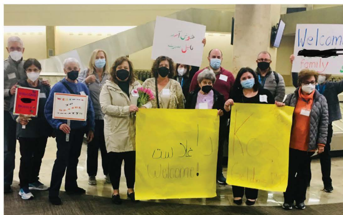
Members of 3 OCJCR Welcome Circles await the arrival of Afghan refugees. OCJCR is currently resettling 9 Afghan families.