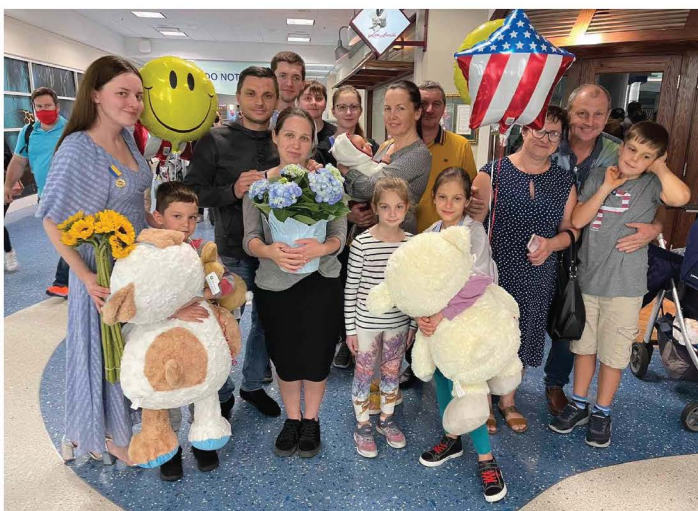
OCJCR aided this Ukrainian family by providing short-term accommodations in Orange County until air travel could be arranged and funded by OCJCR. Here the Ukrainian family is reunited with relatives in Jacksonville, Florida.