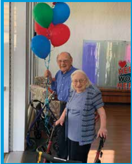
Heritage Pointe Resident celebrating 100th birthday!

“ Heritage Pointe is a nonprofit 170-Resident community in Mission Viejo, California providing assisted living and memory care services and programs for seniors. During the COVID-19 crisis, all Residents have been self-quarantining, restricting all family visits, volunteers, and non-emergency medical appointments. As the average age is 92, this enforced guideline is for their safety and protection. Residents do not