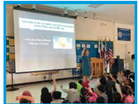
ADL No Place For Hate pledge at local school

“ The core of ADL's work is to respond to incidents of hate, learn from them, and prevent them from occurring. Everything we do can be traced back to our mission: to stop the defamation of Jewish people and secure just and fair treatment for