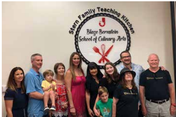
The Bernstein and Pepper families